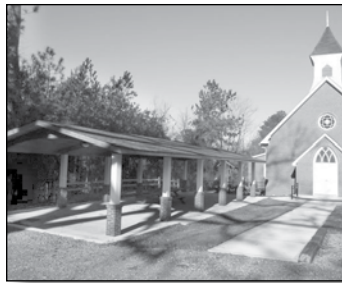
New pavillion built in 2011