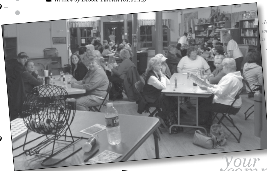
January's Bingo Night was a hit. Come join us in February and support Bynum Front Porch Scholarship Fund.